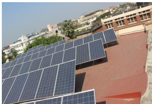
Photograph of installed rooftop solar panels